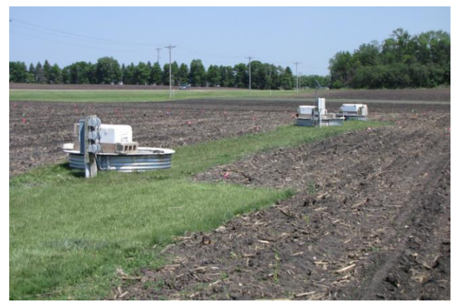
Plots to collect drainage water were established at the Southern Research and Outreach Center in Waseca in 1975. The collection of data was automated in 2009.

Research data on nitrate loss from cropping systems through drainage systems is not as common as one might think. In Minnesota there are plots used to measure drainage water quantity and quality located at the University of Minnesota Research and Outreach Centers in Waseca (SROC) and Lamberton (SWROC). These were established in the early 1970s. In the nearly 40 years that these plots have been used, they have examined many of the aspects of N management including: rate, application timing, source, and the use of nitrification inhibitors. In addition, they have looked at various crops grown in rotation, tillage practices, and mineralization of N from soil organic matter.