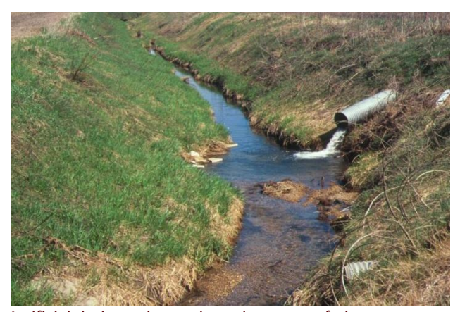
Artificial drainage is not the only source of nitrate to surface waters, but it is the most easily seen, and measured, and therefore under more scrutiny than other transport mechanisms.

not usually lead to increased plant and algae growth (considered significant surface water quality problems). For decades, there has been no established contaminant standard for nitrate-N in class 2 (aquatic life and recreation) waters in Minnesota ( A Minnesota Farmer's Guide to Federal and State Clean Water Law , Carlson et al., 2012). Standards are currently under development, though, and are being phased in over the next few years.